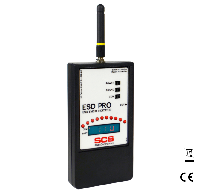
Figure 1. SCS CTM082 ESD Pro - ESD Event Indicator